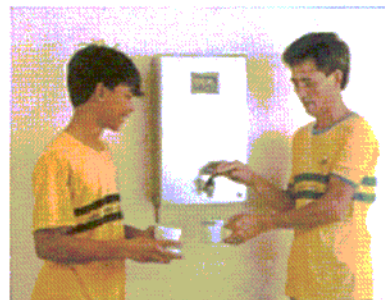
In canteens & larger institutions - IDEAL provides cup after cup continuously.