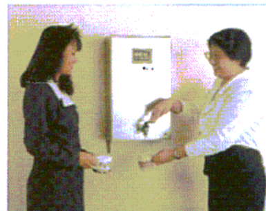
In offices - instant convenience - hot & cold or chilled on tap all day long.